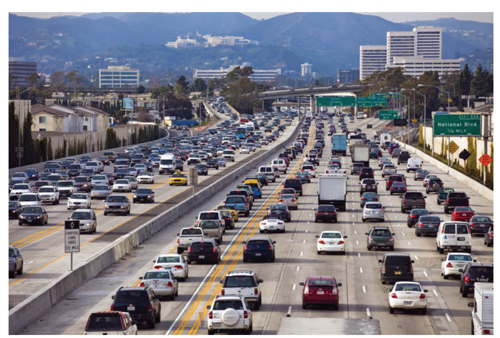
Traffic in Los Angeles