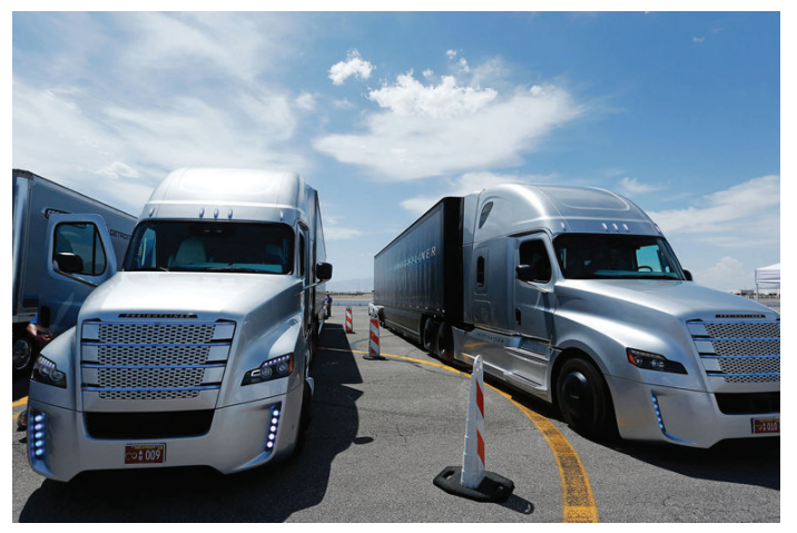
Daimler Freightliner self-driving trucks were demonstrated last spring in Las Vegas.